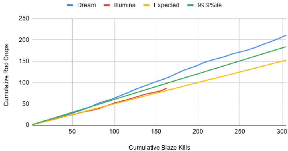
Figure 2: The same for blaze rod drops.